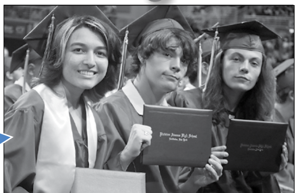
Division Avenue High School graduates proudly processed toward their seats.

Binghamton University Boston University Brittany Beauty Academy Cornell University Dartmouth College Electrical and HVAC/R Training Center Fordham University George Washington University Lincoln Tech Long Island Nail Skin and Hair Institute New York University Pennsylvania State University Rensselaer Polytechnic Institute Rochester Institute of Technology Stony Brook University SUNY College at Geneseo University of California – Los Angeles University of Maryland University of Notre Dame University of Texas Wesleyan University