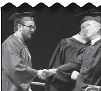
MacArthur seniors became graduates after receiving their diplomas from administrators and trustees.