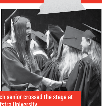
Each senior crossed the stage at Hofstra University.