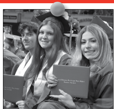
Graduates showed off their diplomas.