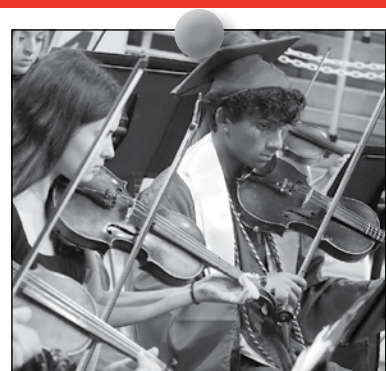
Senior members of the Division string orchestra joined their peers for a performance.