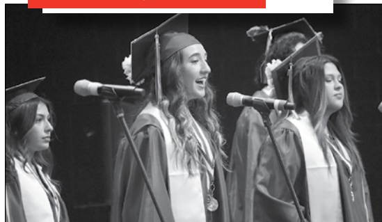
MacArthur senior choir members sang the national anthem and "Slipping Through My Fingers" by ABBA.