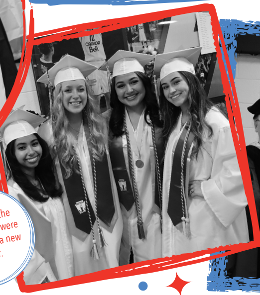
Members of the Class of 2022 were ready to start a new chapter.