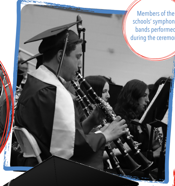
Members of the school's symphonic bands performed during the ceremony.