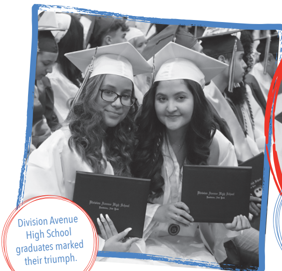
Division Avenue High School graduates marked their triumph.