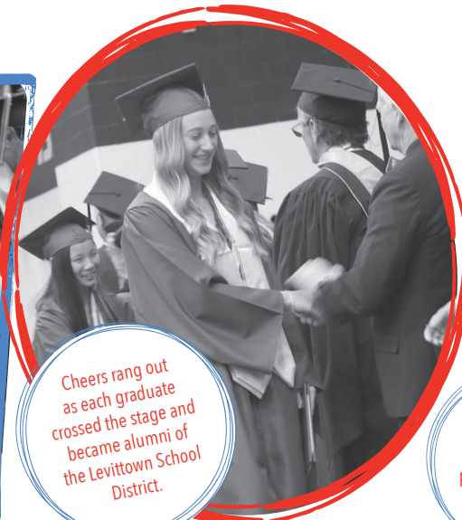
Cheers rang out as each graduate crossed the stage and became alumni of the Levittown School District.