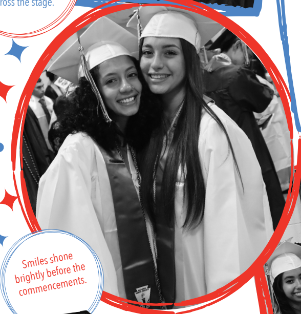
Smiles shone brightly before the commencements.