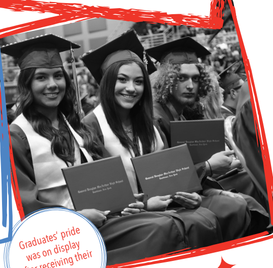
Graduates' pride was on display after receiving their diplomas.