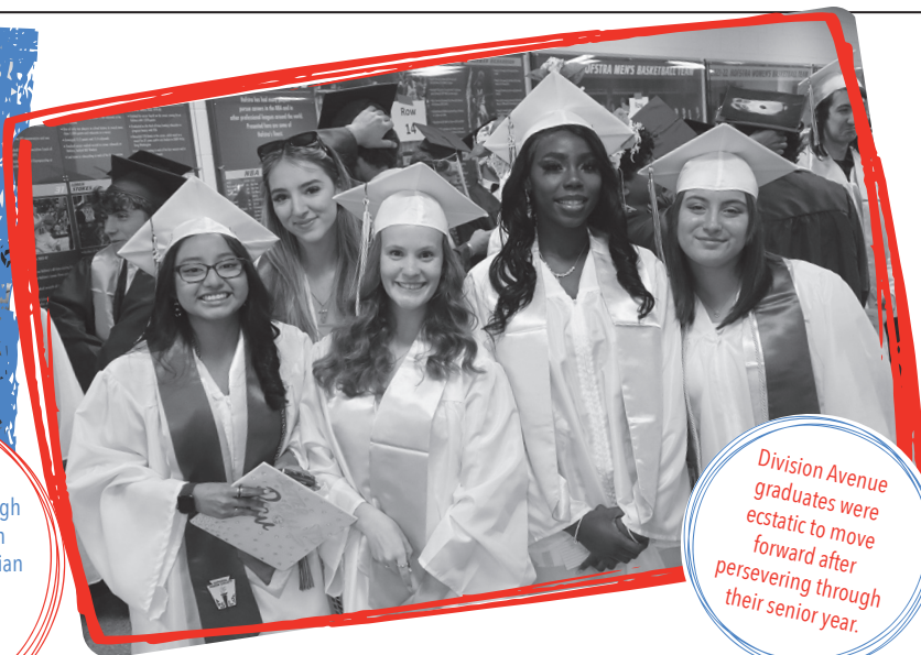
Division Avenue graduates were ecstatic to move forward after persevering through their senior year.