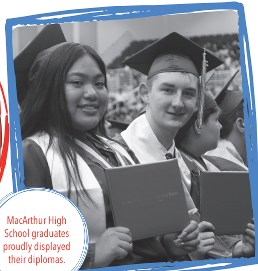
MacArthur High School graduates proudly displayed their diplomas.

Summer 2022 Success for Every Student! www.levittownschools.com