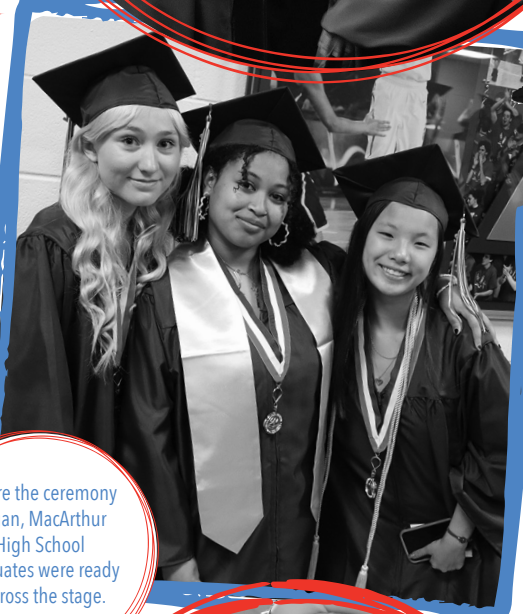
Before the ceremony began, MacArthur High School graduates were ready to cross the stage.