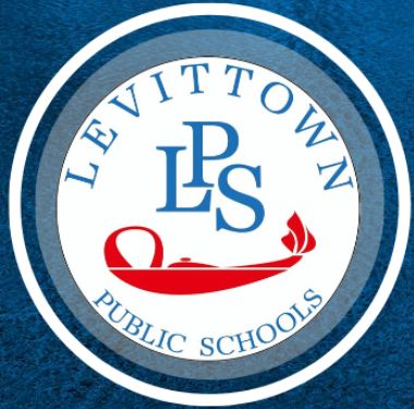
Bus Purchase History