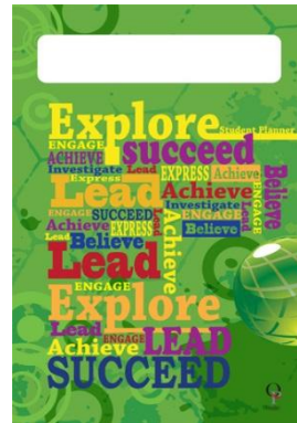
5.5 x 8.5 page size

Please send your order form back to school with your child no later than May 27, 2015 attention Maria Xenios.