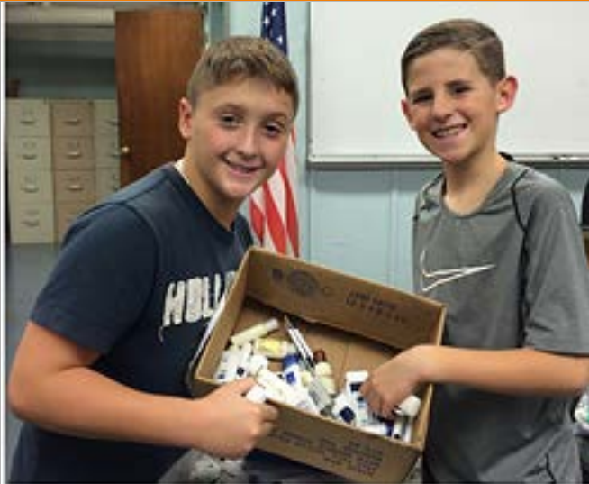
Recreation Club – Turkey Bowl