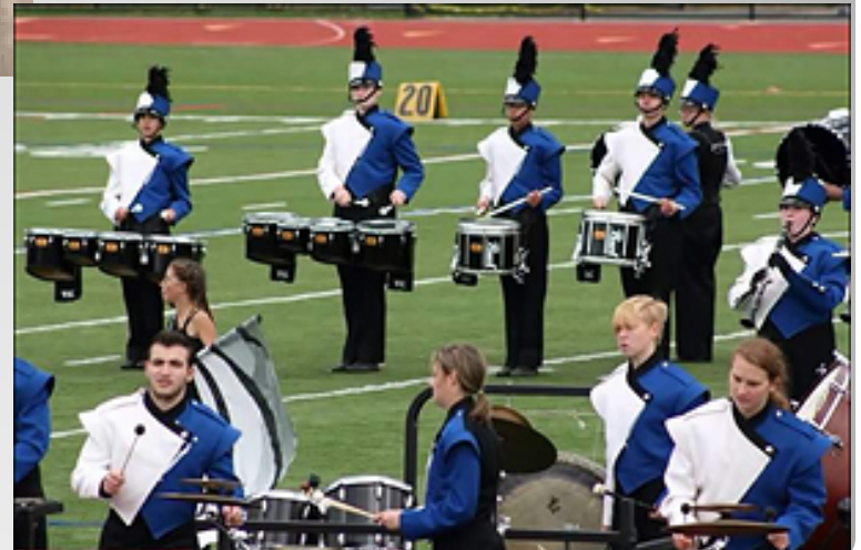
Marching Band – 1 st place finishes