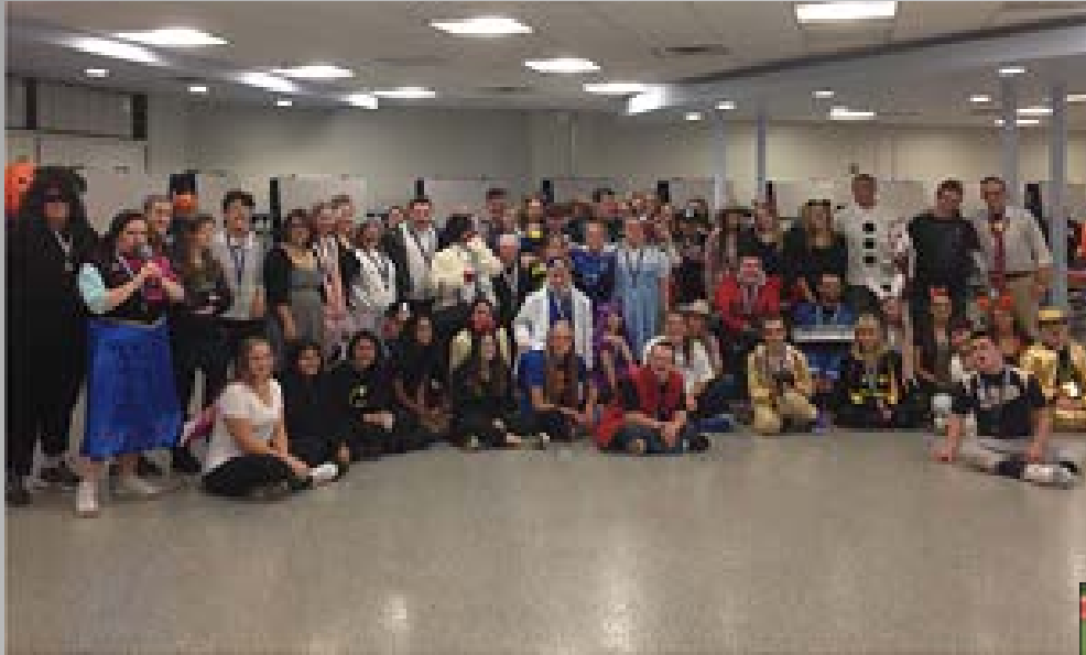
Best Buddies – Halloween Dance