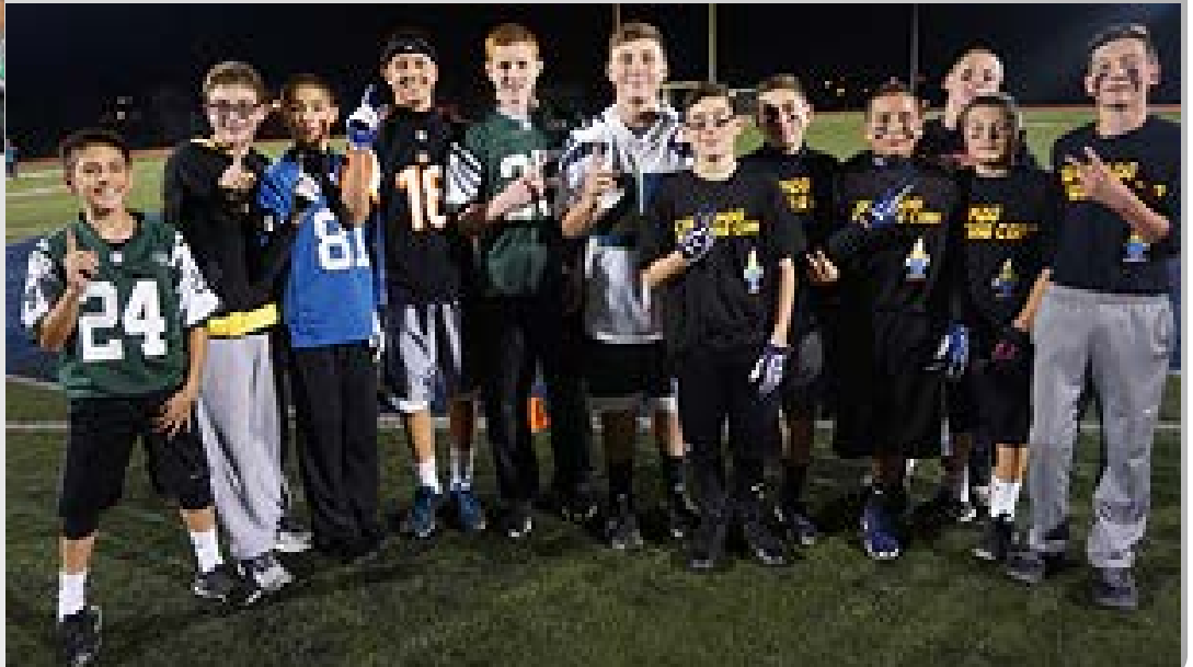
Connections Club – Game Night